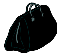
Gearing up to serve you better.

A: YES! As of late February we provide BAT & DOT testing.